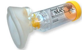
Spacer with face mask